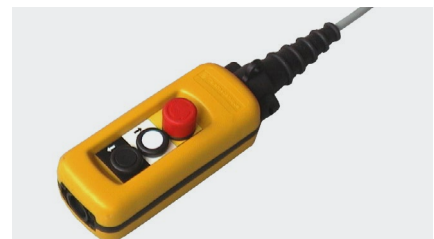
Remote control for cable version