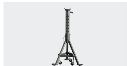
Support stands in different heights